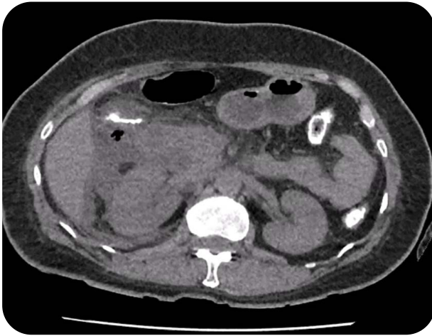
Figure 2. CT scan of the abdomen and pelvis with intravenous (IV) and oral contrast. Right pararenal retroperitoneal collection.

A follow-up study was performed, confirming the right pararenal retroperitoneal collection and a hypodense area in the posterior wall of the second portion of the duodenum, interpreted as a wall defect visible in FIGURE 3 . A duodenoscopy was then carried out up to the second portion, revealing CO 2 filling of the collection bag corresponding to the percutaneous drainage, which indicated the presence of a perforation.