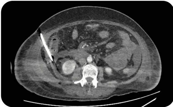
Figure 3. CT scan of the abdomen and pelvis with intravenous (IV) and oral contrast. Image of collection after percutaneous drainage.

A follow-up study was performed, confirming the right pararenal retroperitoneal collection and a hypodense area in the posterior wall of the second portion of the duodenum, interpreted as a wall defect visible in FIGURE 3 . A duodenoscopy was then carried out up to the second portion, revealing CO 2 filling of the collection bag corresponding to the percutaneous drainage, which indicated the presence of a perforation.