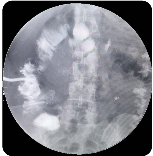
Figure 4. FISTULOGRAPHY. Passage of contrast into the small and large intestine is observed.

The patient received nutrition via nasojejun tube (NJT), later progressing to an oral diet, as well as broad-spectrum antibiotic therapy: Meropenem® 1 g every 8 hours, Sodium colistimethate (Colistin®) 100 mg every 8 hours, and Tigecycline® 50 mg every 12 hours for 14 days. After 40 days of hospitalization, the patient was discharged in good condition, with plans to remove the drain in the following weeks. A fistulography was performed 39 days after drain placement, confirming an enteroatmospheric fistula ( FIGURE 4 ), for which closure was decided. The drain was removed without complications one week later.