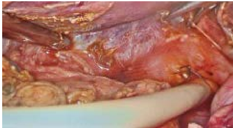
Figure 1. Entrance of the T-tube to the place where the choledochotomy was performed is observed, along with the suture points.

common bile duct to up to 10 mm, with a 5 mm signal voids compatible with calculi. An ERCP was performed based on the aforementioned findings, in which the duodenal papilla could not be identified, therefore, the extraction of choledocholithiasis was not possible and so surgical therapy was performed: laparoscopic choledochotomy with calculi extraction with a Fogarty balloon, peroperative cholangiography and T-tube placement ( see Figure 1 ). In the peroperative cholangiography, proper contrast passage to the duodenum without residual filling defect's imagery was recorded. The patient had a favorable postoperative course, beginning oral tolerance within the first postoperative day (POD1). Within the POD5 a T-tube cholangiogram was performed, in which proper contrast passage to the duodenum was recorded, without evidence of leaking or signs of signal voids suggesting residual calculi ( see Figure 2 ). The patient is discharged on the POD6 without complications, good oral tolerance, no spontaneous pain nor infection and it is planned for the T-tube to be extracted within POD45. The extraction of the T-tube was performed after the POD45 and annual controls are performed on the patient without complications up to this date.