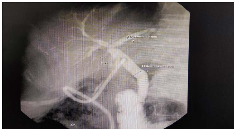
Figure 2. T-tube cholangiogram on POD5, no leaks nor filling defects observed on the bile duct.