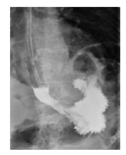
Figure 3. Esophagogastroduodenal x-ray with oral hydrosoluble contrast reveals the presence of stopped content at gastric body level without passage of contrast towards the duodenum.