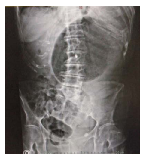
Figure 1. Abdominal x-ray in the dorsal decubitus position showing an image consistent with gastric volvulus, large gastric distention, and nasogastric tube inside. Displaced transverse colon underneath.