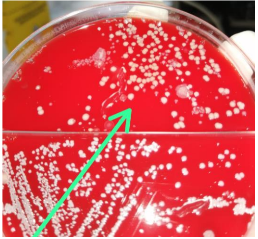
Figure 1. Isolation of S. aureus on blood agar.

Microbiological analysis: Sampling from the oral cavity was carried out with sterile swabs. The samples were transported in a thioglycolate medium and cultured on salty mannitol agar. Mannitol-positive colonies were cultured on blood agar, identifying S. aureus by conventional biochemical tests that included positive results for catalase, coagulase, DNAse and latex agglutination test for S. aureus . The resistance study was performed using the disk diffusion method according to the Clinical and Laboratory Standards Institute (CLSI) and 11 antibiotics were included. The antibiotics used in the test were penicillin, cefoxitin, oxacillin, vancomycin, erythromycin, ciprofloxacin, clindamycin, rifampicin, trimethoprim, tetracycline, and gentamicin.